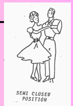
SEMI CLOSED POSITION

You can also attend BC Festival 2025 July 31, Aug. 1 & 2 in Langley after the Cuer school (Register separately for the Festival)